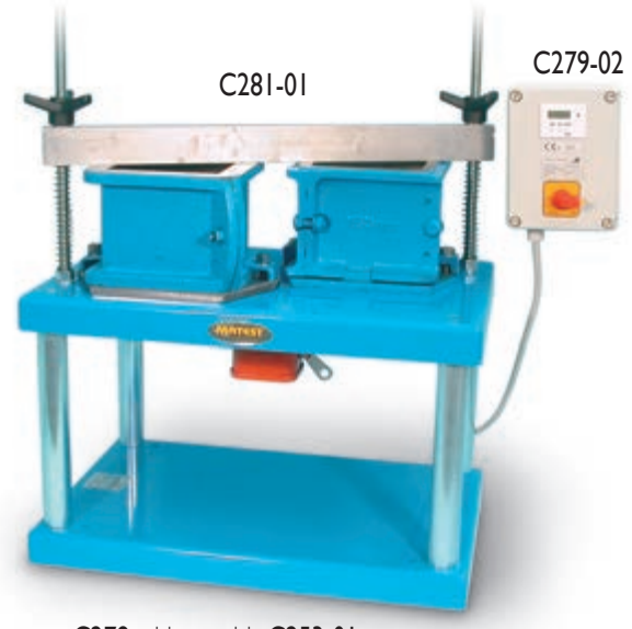
C278 with moulds C253-01