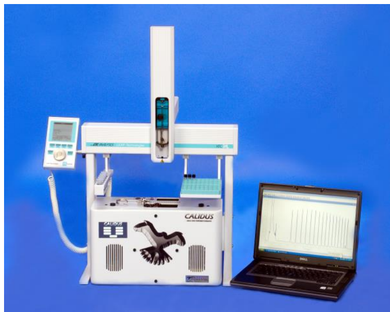
CALIDUS™ GC with optional autosampler and laptop interface.

FASTER – With analytical cycles 10 to 50 times faster than traditional gas chromatography, the CALIDUS™ GC vastly increases responsiveness for the data consumer. Less time spent waiting on results means more productivity and timely control of the measured process. In the hands of lab and process managers, the speed of the CALIDUS GC can translate into better quality products, produced faster and more profitably than ever before.