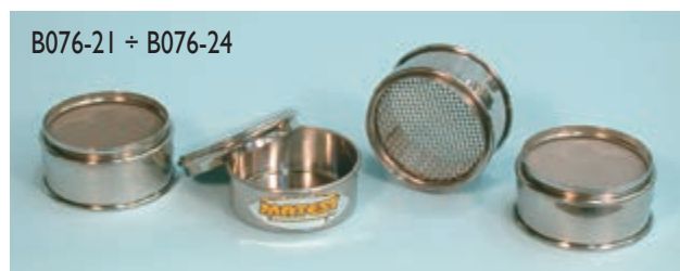
B076-21 ÷ B076-24

B076-24 Pan and Cover, stainless steel, 75 mm dia.