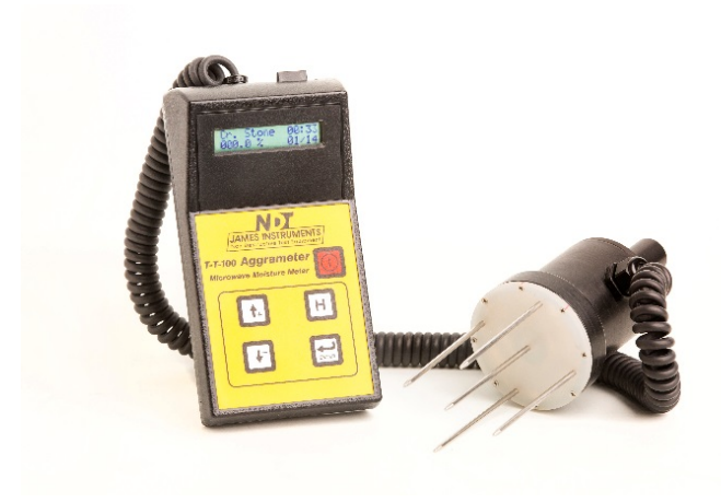
Aggrameter Instrument and Sensor

For instantaneous determination of the moisture content of sand, fine aggregate and coarse aggregate using a unique microwave sensor