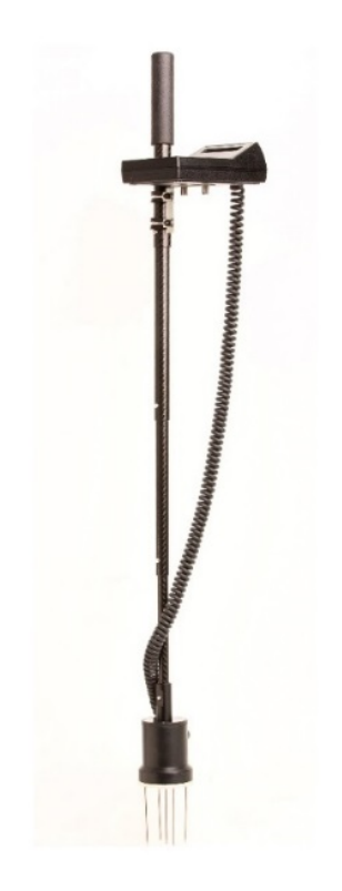
Aggrameter and Extension Pole