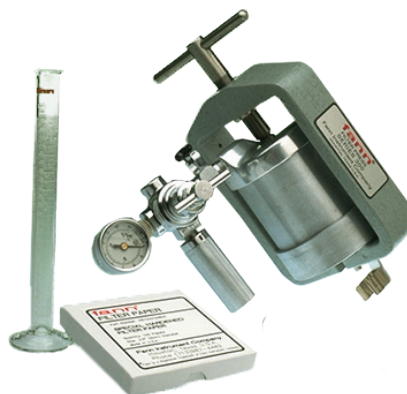
Wall Mount Filter Press Assembly Part No. 207503