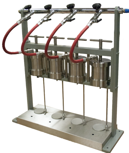
Four Unit Filter Press Assembly Part No. 207785