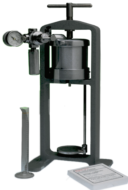
Filter Press w/CO 2 Pressure Assembly Part No. 207224