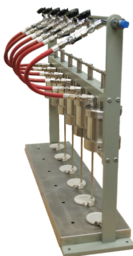
Six Unit Filter Press Assembly Part No. 207673

Fann Instrument Company offers a complete line of equipment, materials, and supplies for analyzing various drilling fluids and oil well cements in accordance with API Specifications and API Recommended Practices.