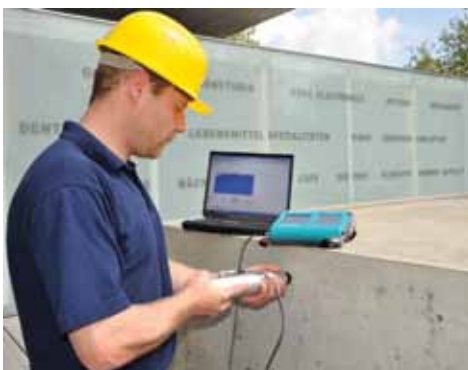
Control and data transmission to PC/Laptop