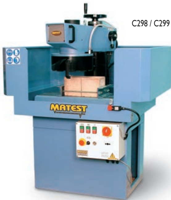
C298 / C299

The grinding machine is supplied complete with a collecting and water decantation tank, a motorpump, a large protection waterproof carter, eight abrasive charges. Supplied "without" locking stirrups and diamond grinding sectors to be ordered separately (see accessories).