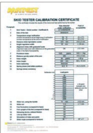
Calibration certificate to EN 1097-8