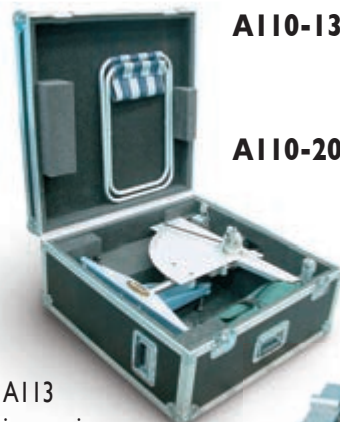
A113 in carrying case