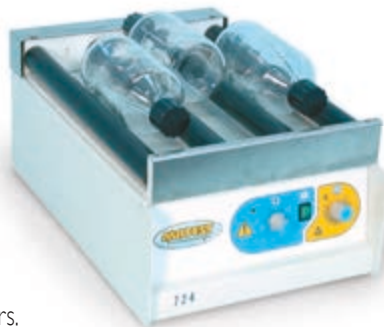
B022 + B022-11

Dimensions: 385x295x160 mm. Weight: 10 kg approx.