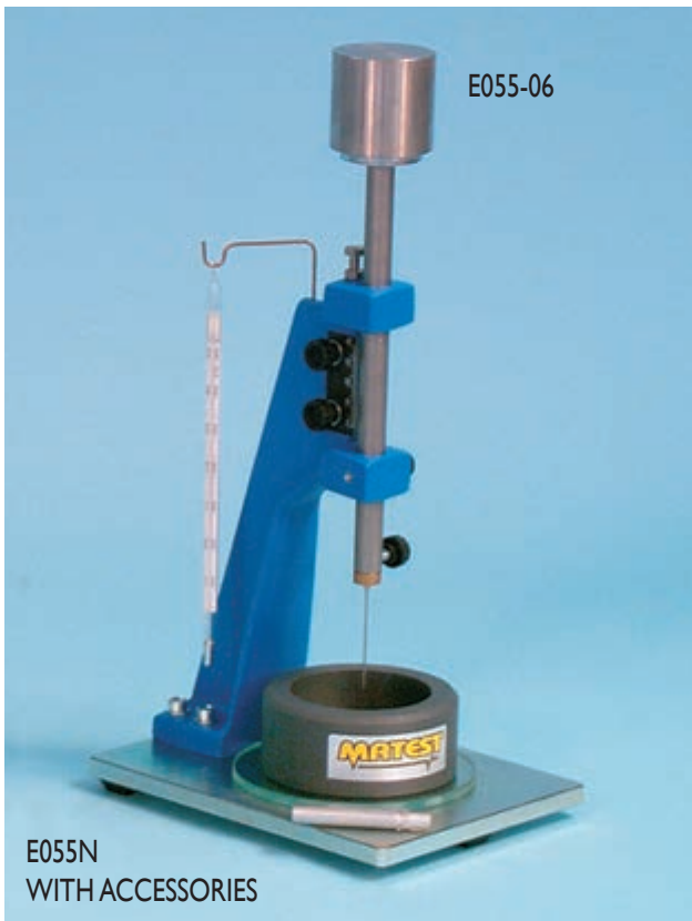
E055N WITH ACCESSORIES

E055-15 Probe, total weight of 100 g for tests on gypsum, EN 13279-2 / DIN 1168