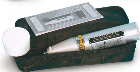
C380 with case