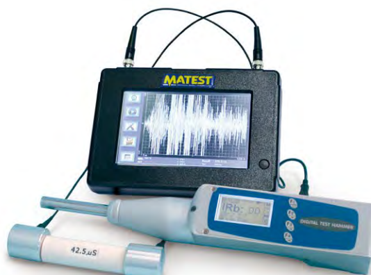
C386N + C372M

The digital Matest test hammer is suitable to be connected to the Ultrasonic Tester high performance mod. C372M (see p. 372) for combined ultrasonic and rebound tests with automatic data acquisition, processing and store of the results.