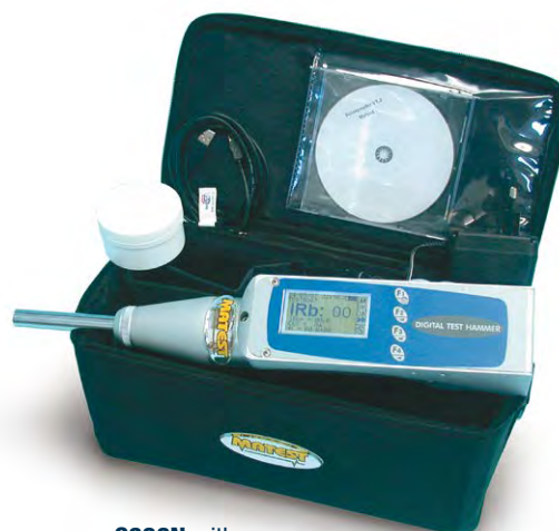
C386N with case