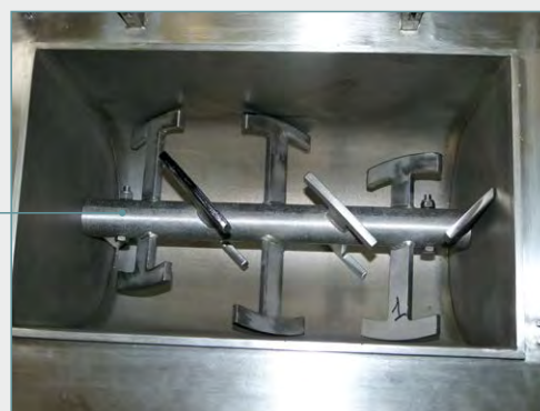
Detail: mixing shaft with helical blades