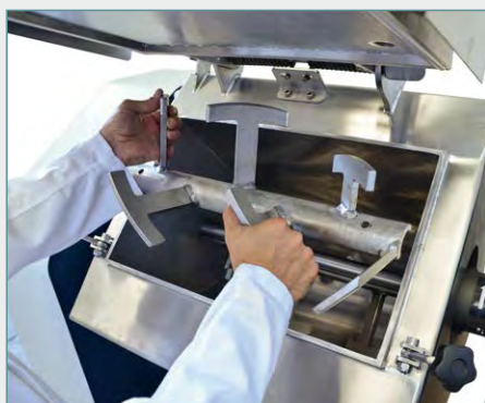
B026-05N Detail of the detachable mixing shaft